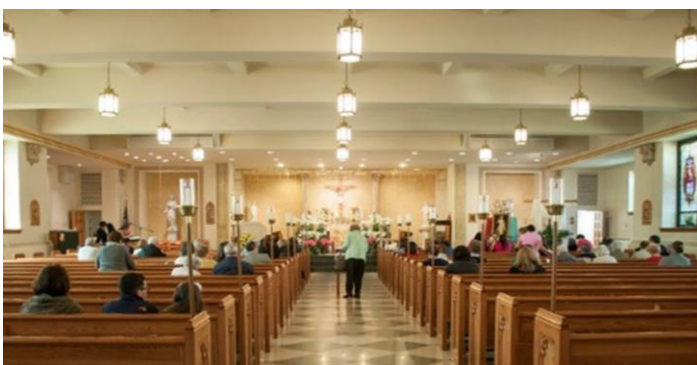
St. Vito's before Hurricane Ida

Despite the devastation, parishioners were out providing food and assistance to the community, especially the homes and apartments that were under water. And like the rest of the community, rebuilding begins.