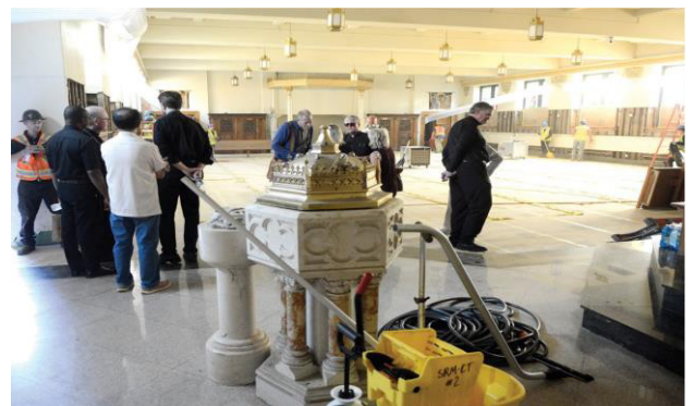
St. Vito's after the waters were cleared