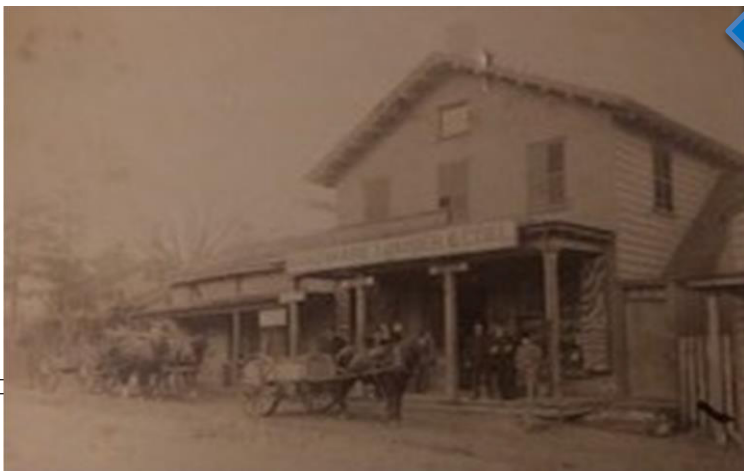
Brewer's in the Early days of business on Boston Post Road