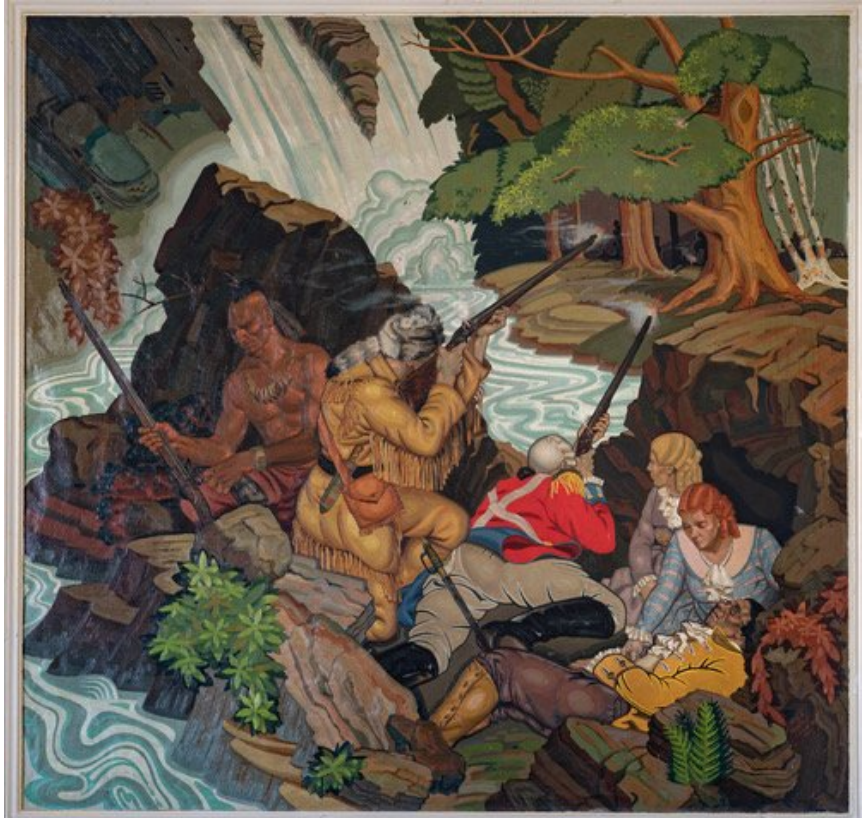
'Defence of the Rock' from "The Last of the Mohicans'